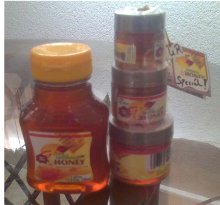
U R Special towers of Love (shrink wrapped 1,1.6,3oz )