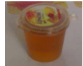
.5oz Tapered net (.72oz, 12.1ml)