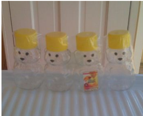
D Bear Essentials ( 4 shrink wrapped 2oz bears - others possible )