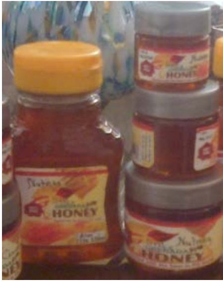
Real Nutmeg Inside!