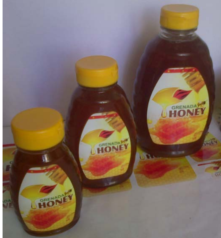
BSBS 8oz- classic net ( 8.2oz, 233g 162 ml)