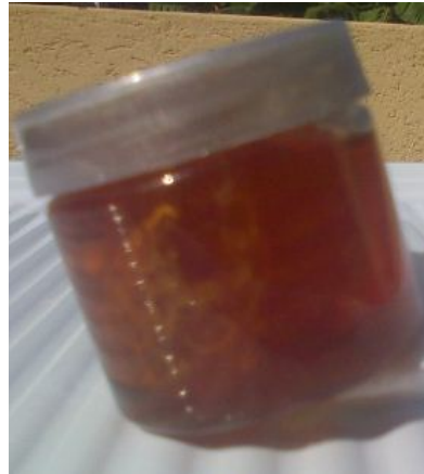
Honey comb Jar ( 1,1.6,3oz - Limited quantities)