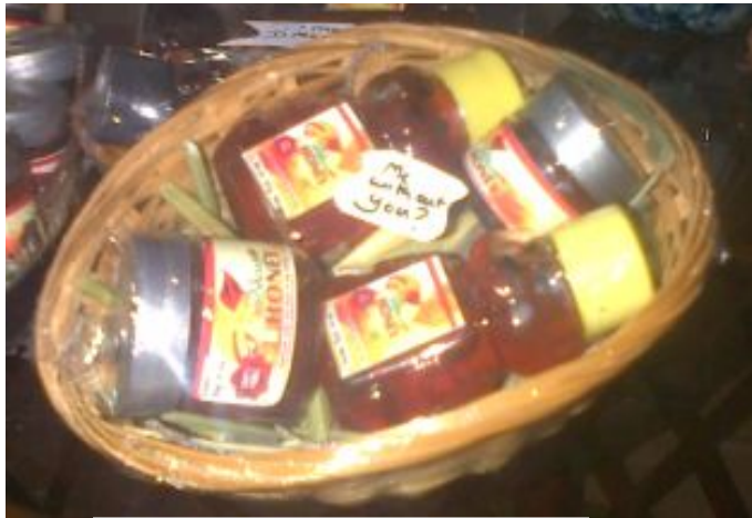
Me without You Basket ( 2 2oz bears, Sks 1oz , Sks 1.6 oz)