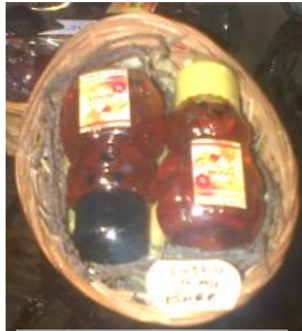
Just U n Me Basket ( 2 2oz bears)