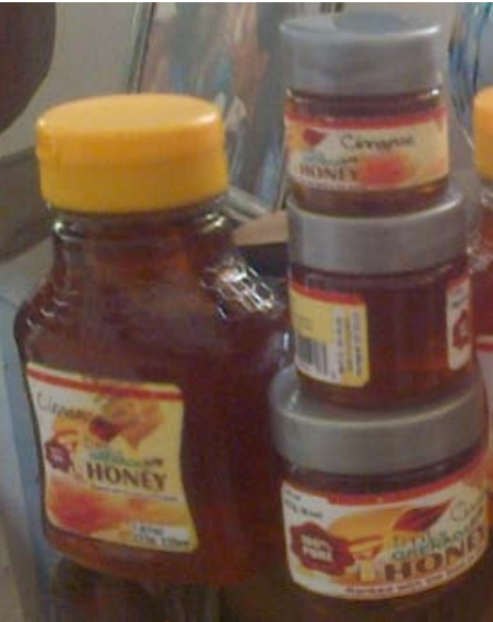
Real Cinnamon Inside!