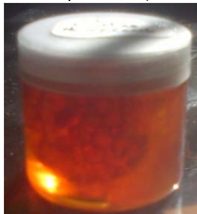
Enquire about 2 larger sizes jars or glass options