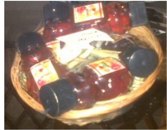
D more D merrier Basket (5 2oz bears (above), flavored honey (Below))