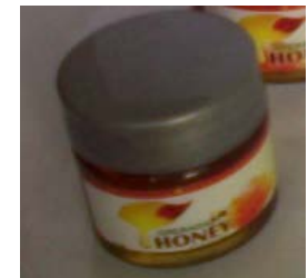
SKS 1oz net( 1.0 oz, 17.2 ml)