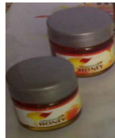
BSBS 8oz- classic net ( 8.2oz, 233g 162.1 ml)