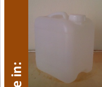
1 Us Gal