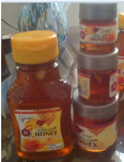
Real Ginger Inside!