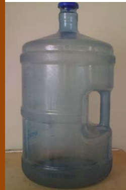
5 us Gal