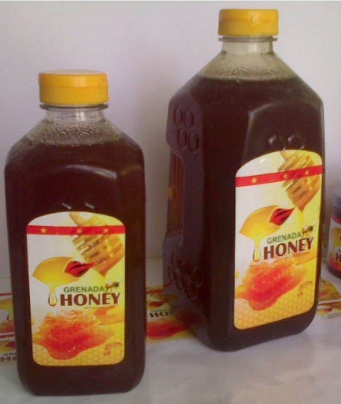
BSBS 3lb Net (47.4 oz, 1.35 kg, 937 ml)